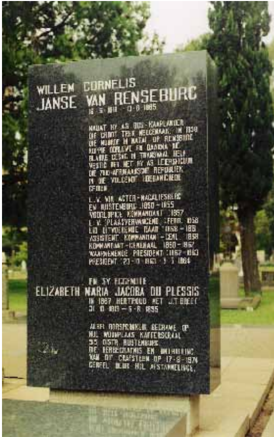
In the Heroes' Acre, Pretoria West Cemetery. Second President of the Zuid Afrikaansche Republiek.

Still on the increase, it can never be said that we have enough volunteers. It is always exciting to see an e-mail from a previously unknown person, enquiring as to whether we would be interested in the recordings they have made, or in the photos they have taken.